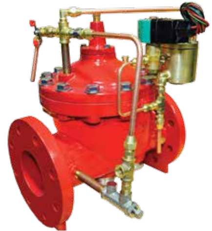
106-EPDV A-10506A Globe